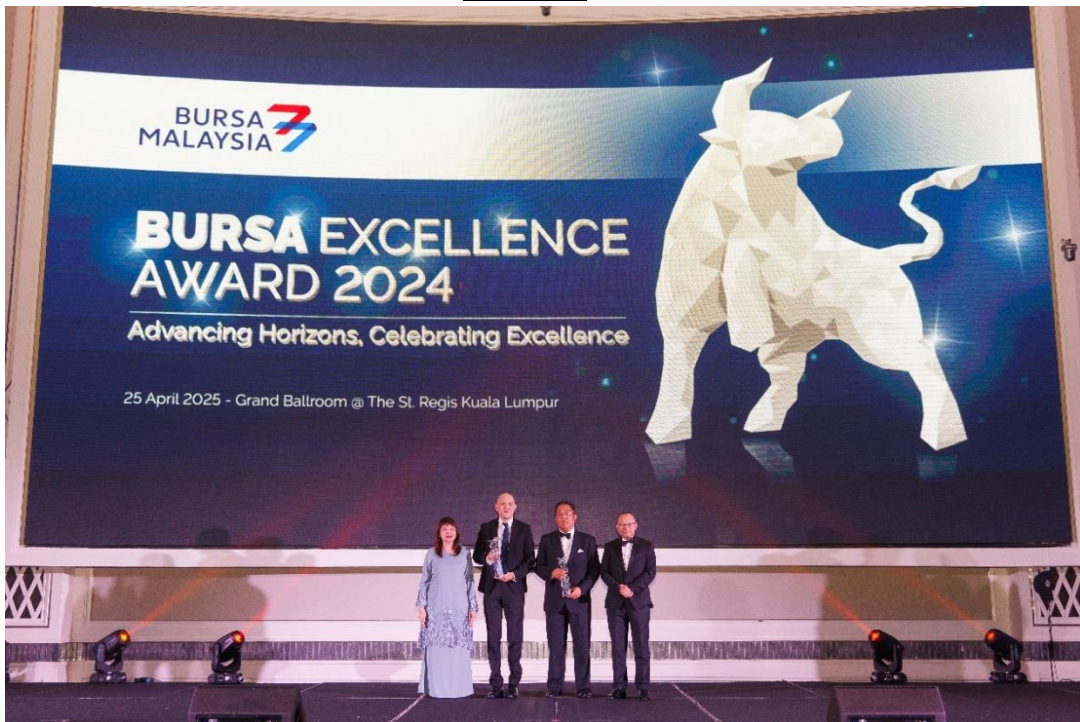
YB Lim Hui Ying, Deputy Minister of Finance, presenting the 'Special Award – Innovation' to Affin Hwang Investment Bank Bhd (2 nd from left) and the 'Special Award – Thought Leadership' to Eq8 Capital Sdn Bhd (2 nd from right), witnessed by Tan Sri Abdul Wahid Omar, Chairman of Bursa Malaysia.