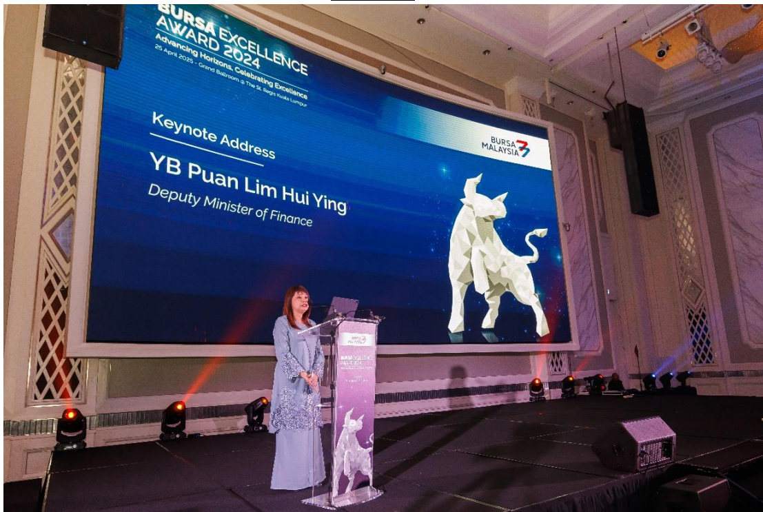
YB Lim Hui Ying, Deputy Minister of Finance, delivering the Keynote Address at the Bursa Excellence Awards 2024.